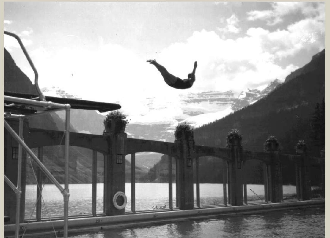
NA71-4910 Open-air swimming pool on the shores of Lake Louise

In 2025, the luxury of lakeside bathing returns to Chateau Lake Louise, with the introduction of BASIN Glacial Waters. Resting on the exact location of the original open-air pool, BASIN represents the contemporary redesign of the outdoor bath experience, imagined for the modern-day wellness seeker.